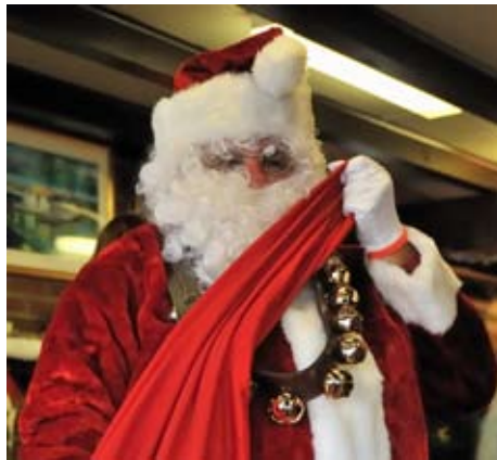
Santa has just arrived at the Holiday Party on December 7, 2008, and is distributing his gifts.