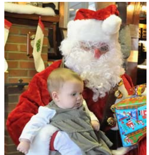
Santa with the littlest child at the party.

[More pictures from the party can be seen linked to our web page at www.designinc.com/myc.htm .]